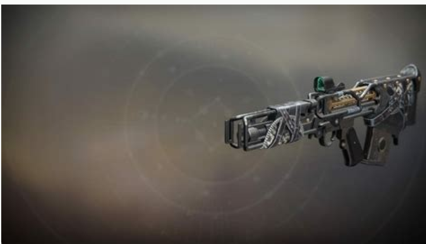
Best legendary pulse rifle destiny 2. Best arc pulse rifle destiny 2. Destiny 2 best energy pulse rifle pve.